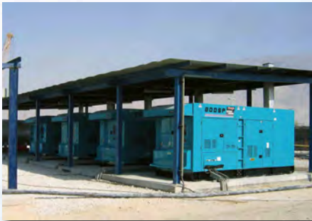
As the power source in the area where electricity is unavaible.