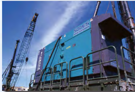
As the power source in the construction site.