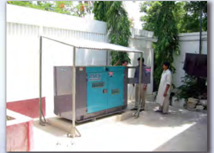
As the Emergency power source in the hospital.