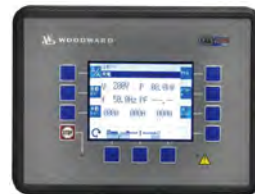
EASY GEN 3500

(5) The generator may be classified as a normal use generator according to the Electricity Enterprises Law depending upon the installation and operation procedure. Consult with a sales person for details.